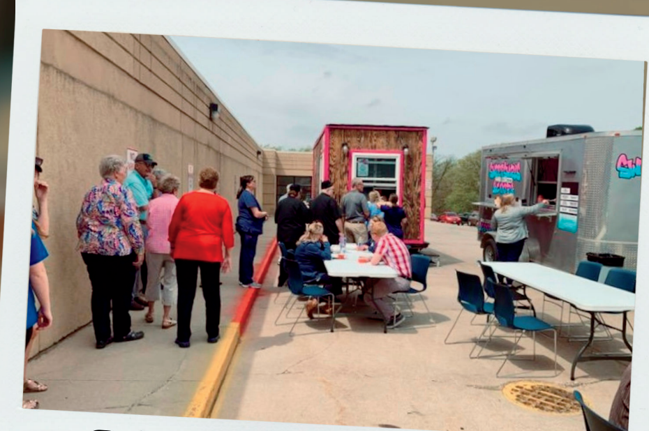
Food trucks to celebrate Hospital Week