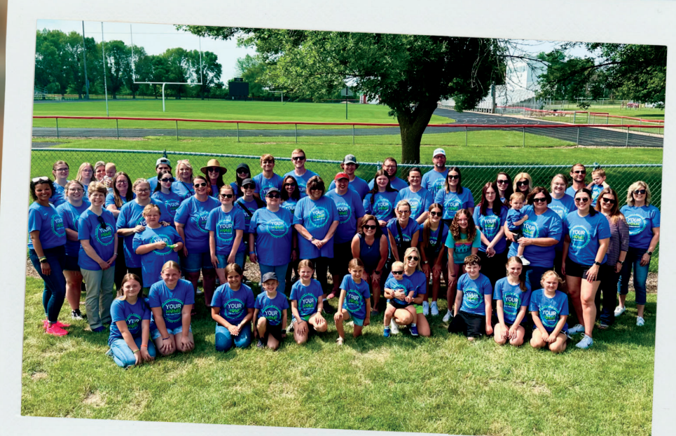
2023 Bell Tower Parade