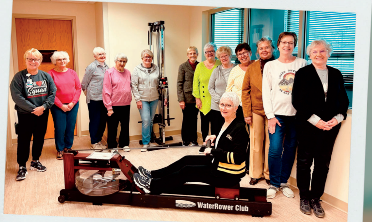
The Greene County Medical Center Auxiliary donated a rowing machine to the Care Management Department.