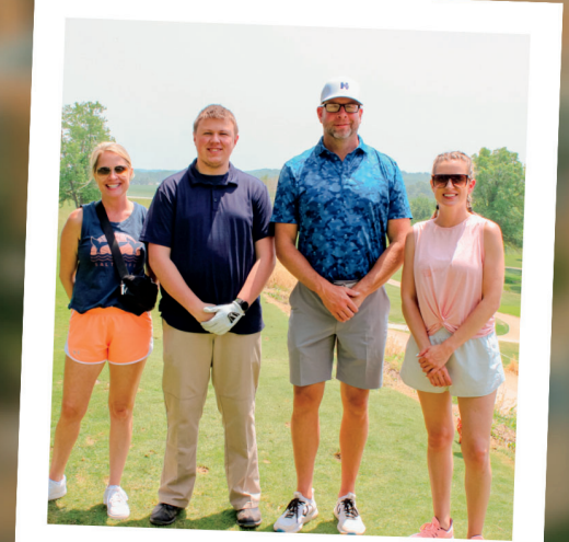
2023 Chamber Golf Tournament Team