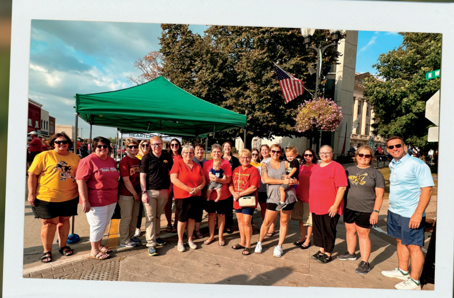
WHO 13's 2023 RVN stop in Jefferson